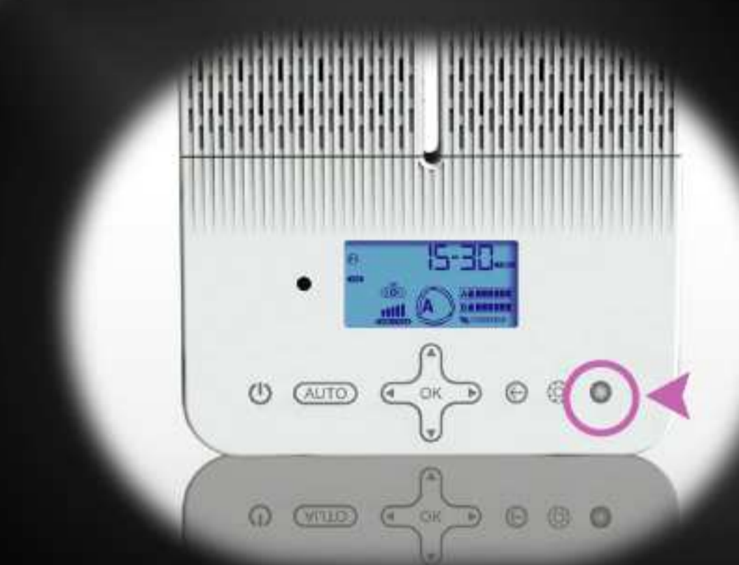
■ Infra-red motion detector