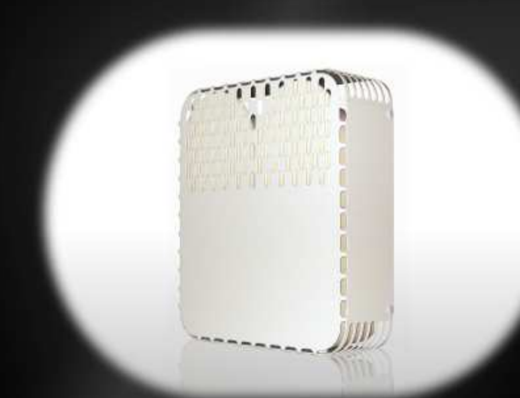
■ Protective casing