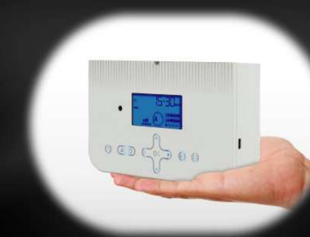
■ Plain diffuser, no options