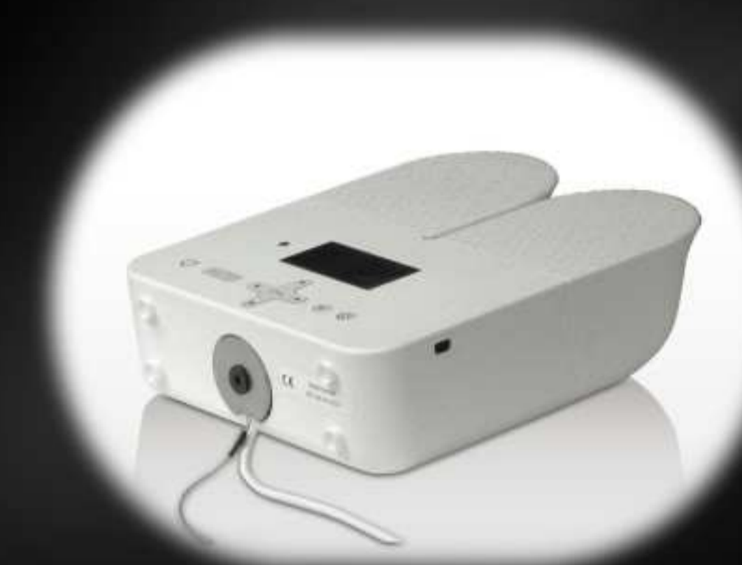
■ Antitheft device

To better adapt to operational constraints, the system can be equipped with a number of options :