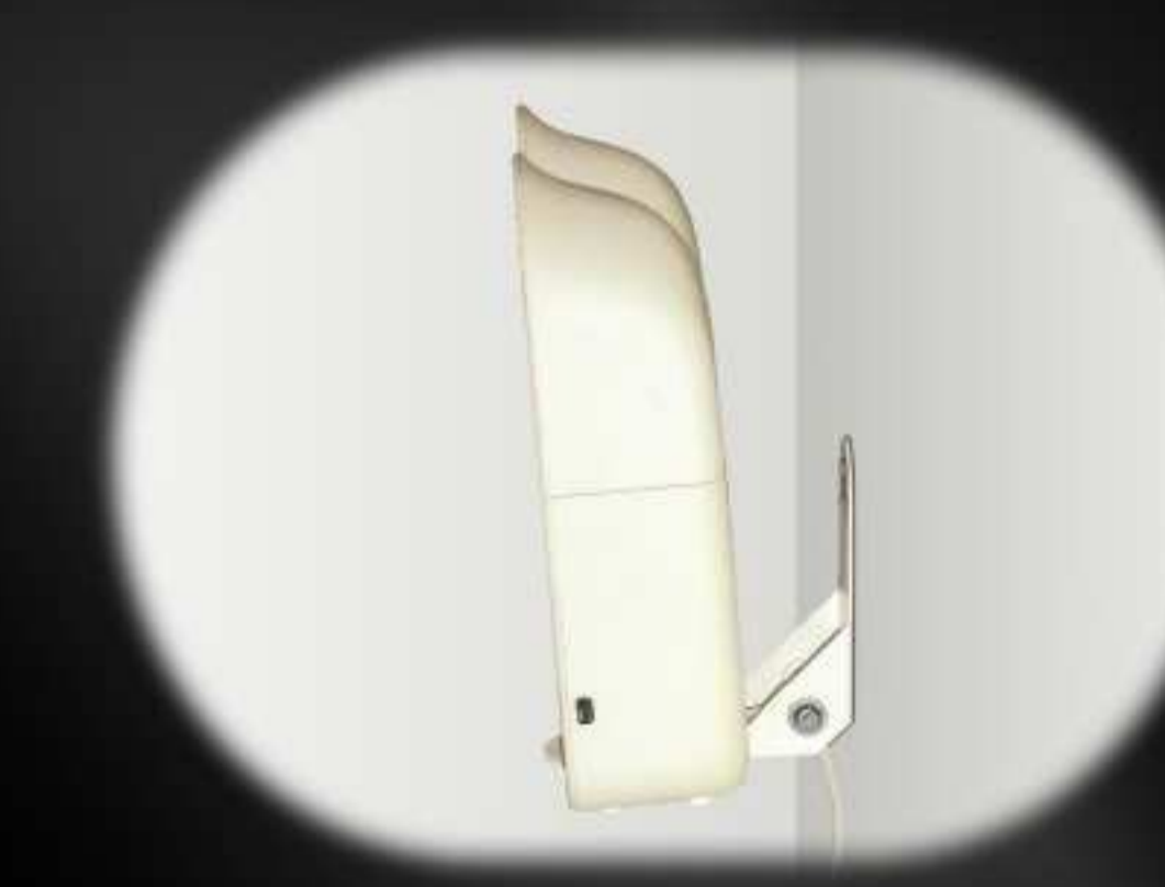
■ Wall-mounting hook