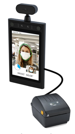
Automatic Ticket Dispenser